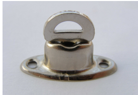
617 Otočný turniket vyšší velorex

\text{Ø}/D [mm] = 28 x 22 \text{Ø}d [mm] = 15 x 9 H [mm] = 5