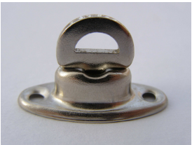
618 Otočný turniket nižší velorex