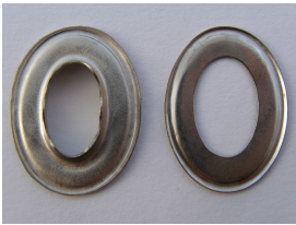
616 Plachtový ovál velorex

\text{Ø}/D [mm] = 28 x 22 \text{Ø}d [mm] = 15 x 9 H [mm] = 5