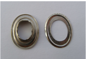
620 Plachtový ovál na kapsy

\text{Ø}/D [mm] = 24 x 17 \text{Ø}d [mm] = 12 x 8 H [mm] = 5