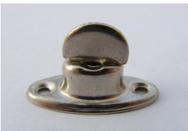
619 Otočný turniket na kapsy

\text{Ø}/D [mm] = 24 x 17 \text{Ø}d [mm] = 12 x 8 H [mm] = 5